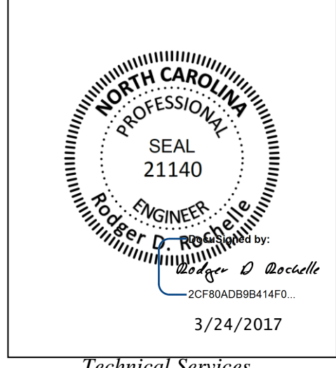
Technical Services Administrator

Accompanying the Design-Build Proposal shall be a bid bond secured by a corporate surety, or certified check payable to the order of the Department of Transportation, for five percent of the total bid price, which deposit is to be forfeited as liquidated damages in case this bid is accepted and the Design-Build Team shall fail to provide the required payment and performance bonds with the Department of Transportation, under the condition of this proposal, within 14 calendar days after the written notice of award is received by them, as provided in the Standard Specifications; otherwise said deposit will be returned to the Design-Build Team.